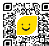
Emergency Call center

※Emergency call center Toll-free (data needed) Available 30 minutes before departure time to 18:30 JST