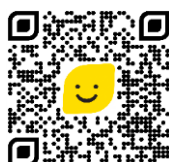
Meeting Points Maps

The Sagano Train is famous for the scenery along the ride. You can experience each season's beautiful view.