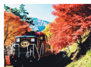
Sagano Torokko Train

Kiyomizudera was named after Otowa Waterfall which is said to be good for your longevity, health and study if you drink it.